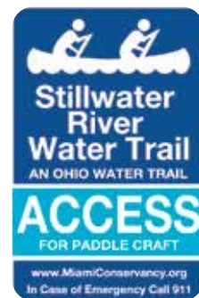
Watch for this sign to help you find access to the Stillwater River Water Trail.

SW 23.4 Land at Fenner Road bridge. The parking area is downstream of the bridge on river right (west side).