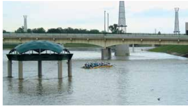
Paddlers should not boat on swollen rivers and streams like this high water on the Great Miami River in downtown Dayton.

Recreation on rivers and streams can be relaxing or thrilling, but it should always be safe. Water offers several real dangers, but with proper training, these hazards are easily managed. Boating safety classes that can teach you to handle water hazards are available around the state of Ohio. Contact the Ohio DNR at 1-877-4BOATER or www.watercraft.ohiodnr.gov for more information.