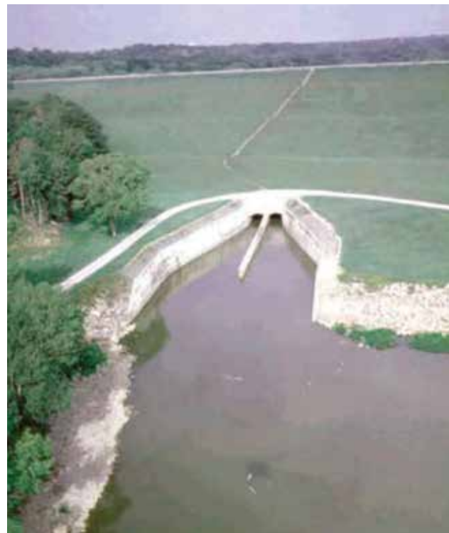
Englewood Dam is one of MCD's five flood protection dams.

It looks calm and peaceful, but a low dam is only 200 feet beyond this boat, well in front of the bridge.