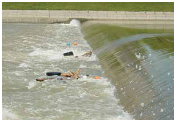
Low dams can be deadly and should always be avoided.

Low dams – like natural waterfalls – are deceptively calm and can be incredibly dangerous. Low dams may range from a 25-foot drop-off to a mere 6-inch drop-off. Water flowing over the dam forms currents that can trap objects and you. Backwash and re-circulating current can trap you back against the dam then underwater before you are pushed along the bottom only to be sucked back to the dam as you rise to the surface. This circulating motion repeats over and over again. The backwash currents may even suck you in if you approach too closely from downstream of the dam. The Mad River has many dams, with several more low dams on its tributaries.